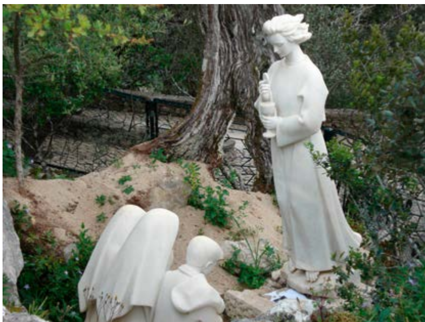
The apparitions of the Angel who prepared the children for the apparitions of Our Lady